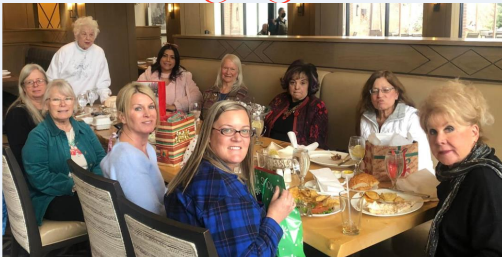
The ladies met at Little America's Silver Pine restaurant to celebrate the season and each other's friendship. These are the things that remind us that the club is about more than cars.