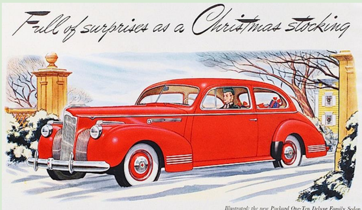
Illustrated: the new Packard One-Ten Deluxe Family Sedan