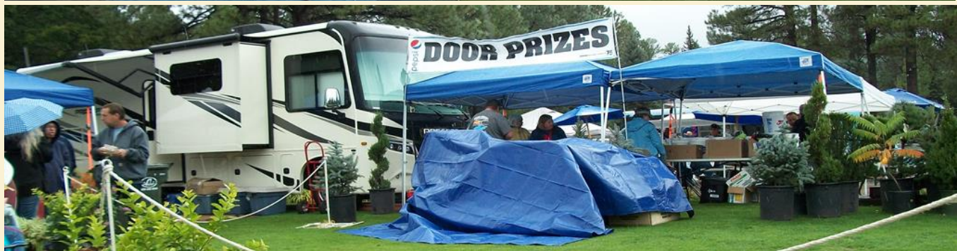
Tarps would have been valauble door prizes.